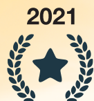
2021 Quality Management System -Certificate from DBS CRET