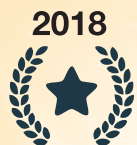
2018 Best Channel Partner, service provider for PAN India - CCSIPL