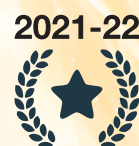
2021-22 Appreciation Award form GST (Govt of India -Ministry of Finance)