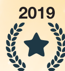
2019 Certificate of excellence award for most reputed service provider with PAN India presence from Indian Navy & MDL