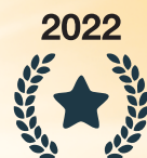
2022 Best Service Provider Company of the year TATA Projects Ltd