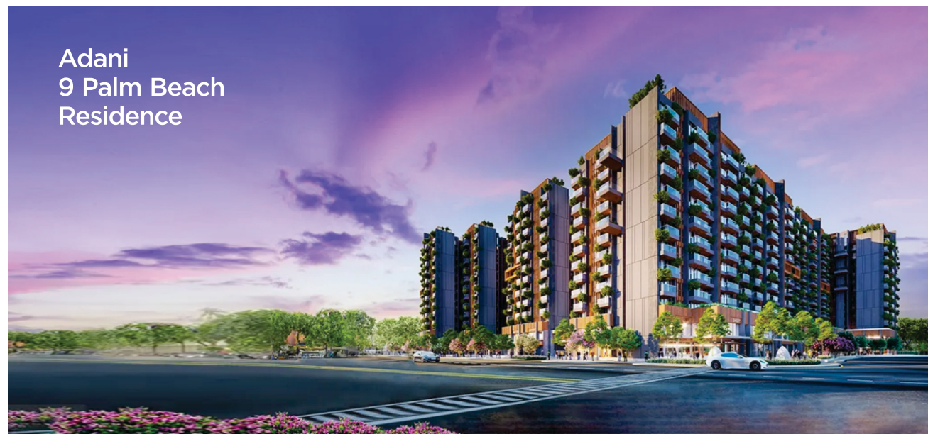
Adani 9 Palm Beach Residence