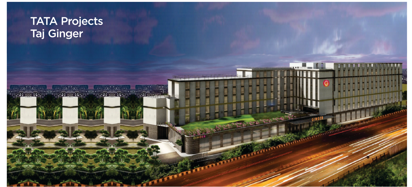
TATA Projects Taj Ginger